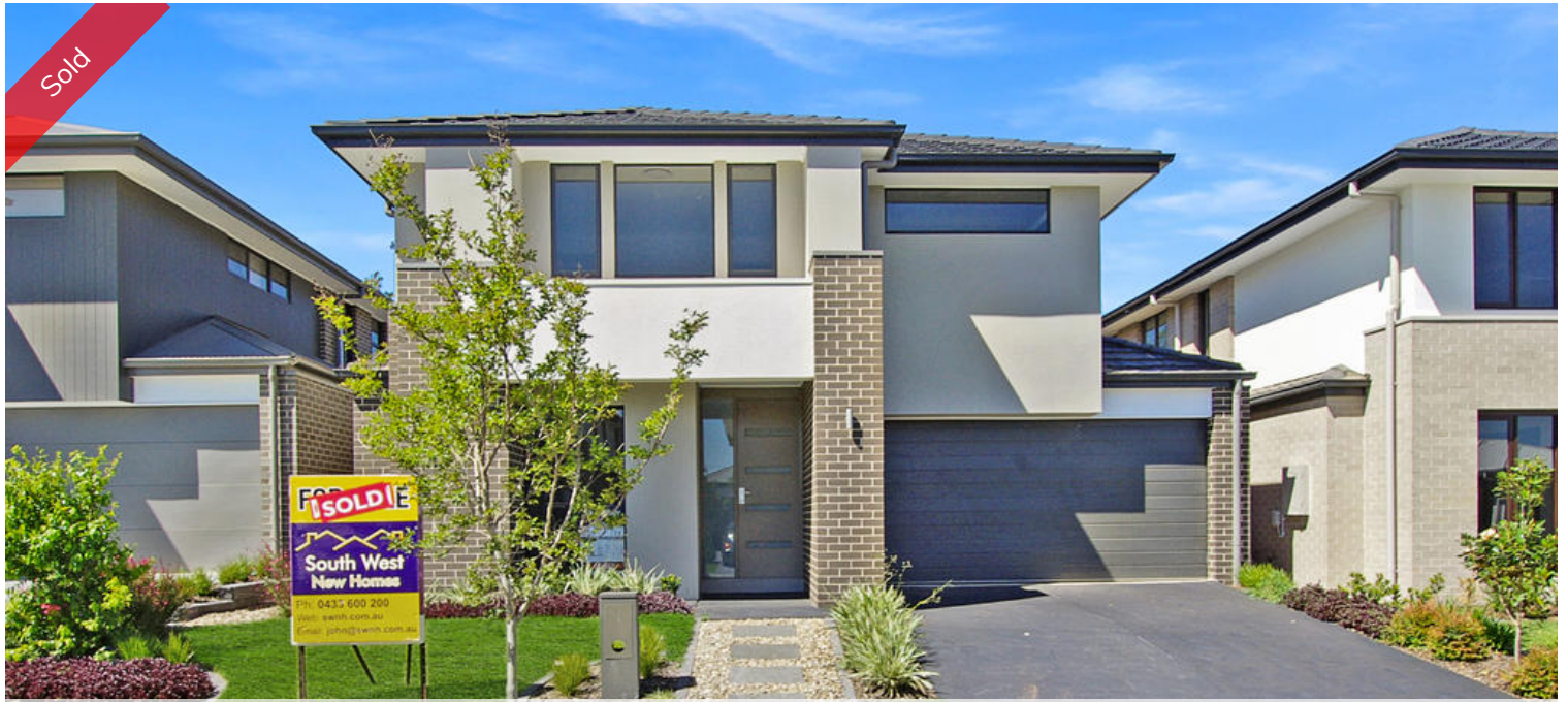
10 Hodgson St, Oran Park